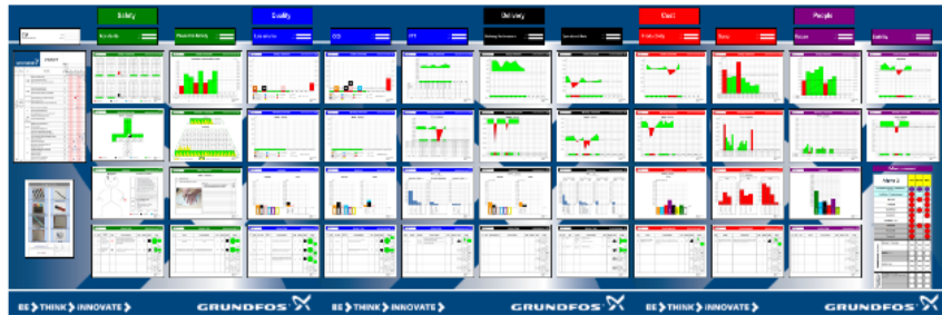
Department DAM board

2011: With the first Lighthouse project in Denmark we started having daily action meetings using paper placed on big metal boards. Making performance management visible for all and including everybody in push towards better performance.