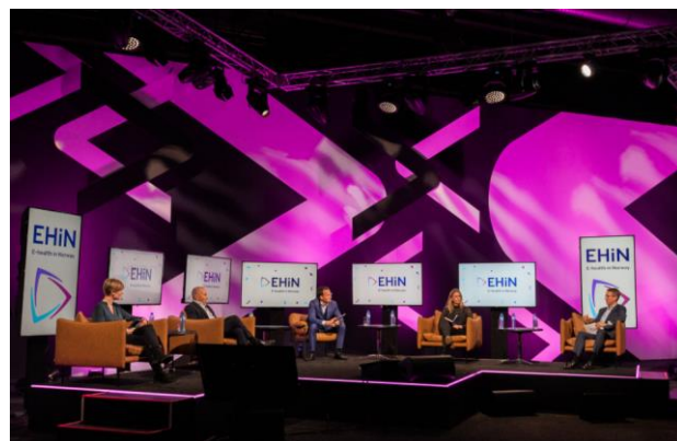
EHiN gathers experts for debate